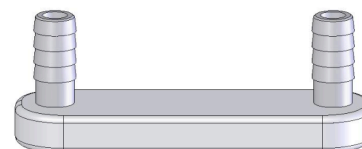
Reactor Retrokit ® Nano-Pro, installed outside the exhaust pipe